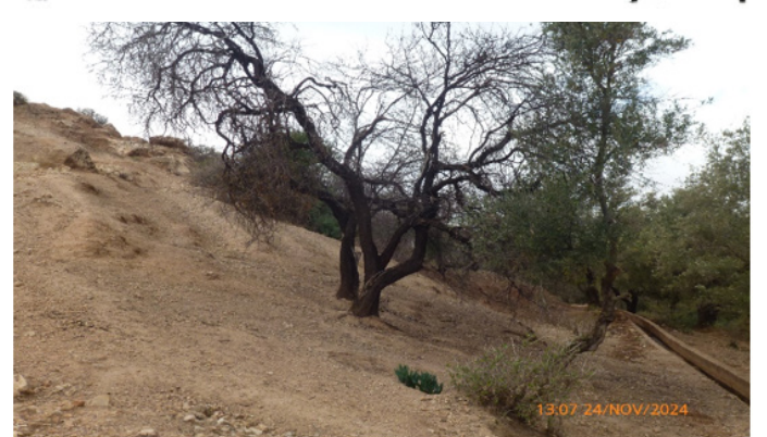
K (24 November 2024)