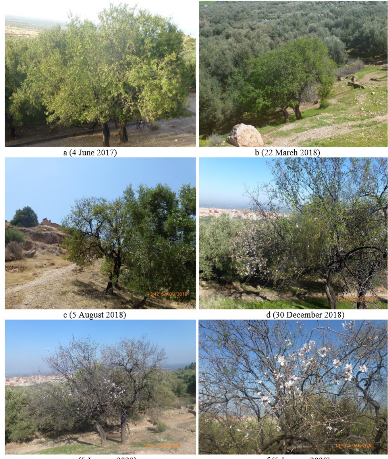
e (5 January 2020)