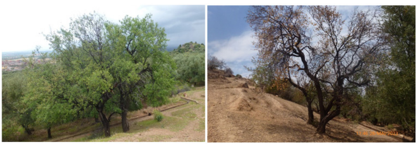
g (22 March 2023)