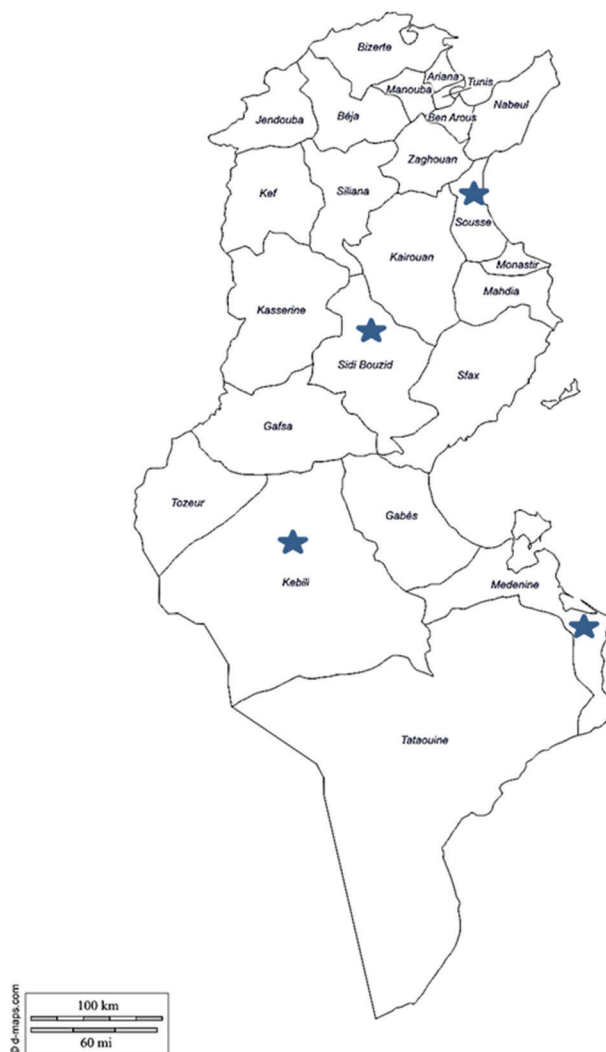
Figure 1: The 4 regions sampled in this study

As we noticed, only positive control sample showed a positive result.