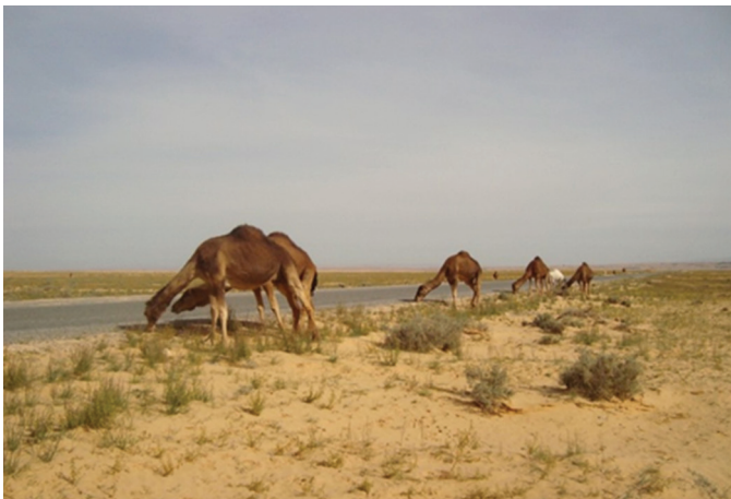
Figure 2: Typical range for extensive dromedary rearing in Tunisia