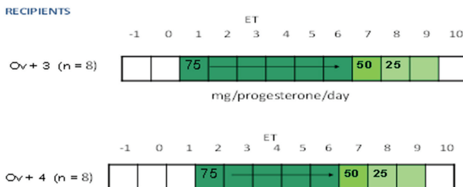
Figure 1: Progesterone treatment protocol for ov + 3 and ov + 4 recipients (from Skidmore and Billah, 2011)

Cooled embryos. Pregnancies can be achieved after transfer of cooled embryos that have been kept at 4°C for 24 h. Embryos are placed in a sealed eppendorf completely